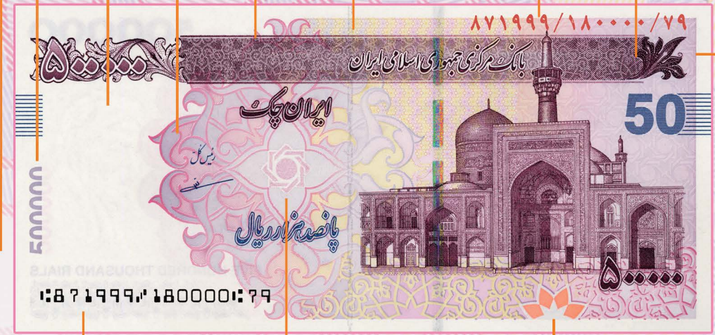
Three dimensional linear design